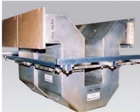
WR-650 Waveguide Patch Panel