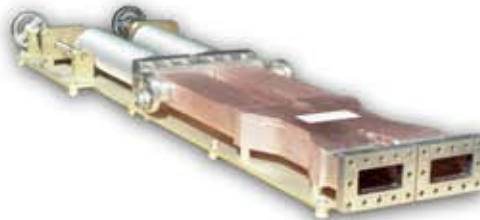
High Power Vacuum S-Band Waveguide Phase Shifter