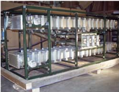
4-Way Isolated Power Combiner