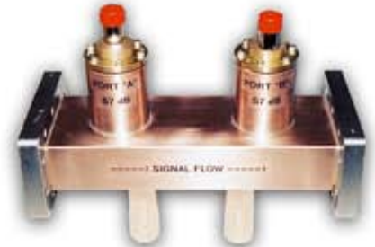
High Power Vacuum Waveguide Directional Coupler