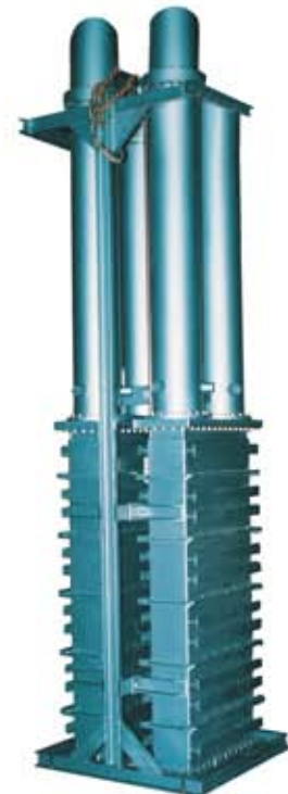
Radiation-Hard Coaxial Motorized Phase Shifter