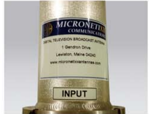
Welds that Surpass Industry Standards