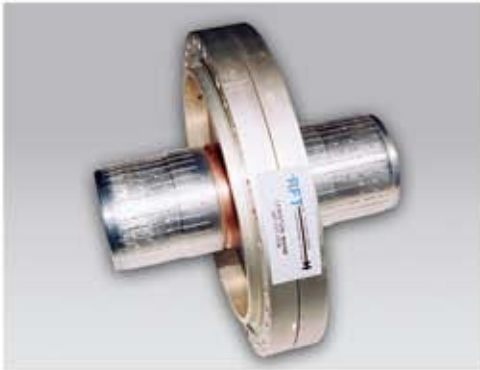
50 Ohm High Power Coaxial Gas Barrier

Micronetixx Technologies has developed special expertise in key engineering disciplines, and our design team is uniquely qualified to deliver superbly-engineered custom components and microwave subsystems for the Scientific and Research communities, on time and within budget.